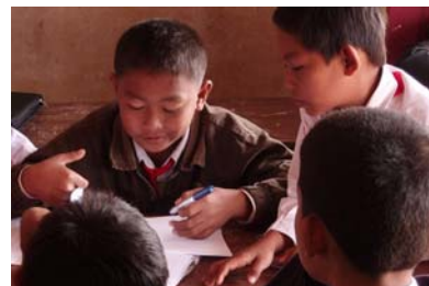
learn new things