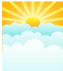
in the day