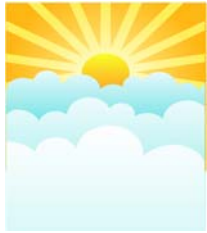
in the day