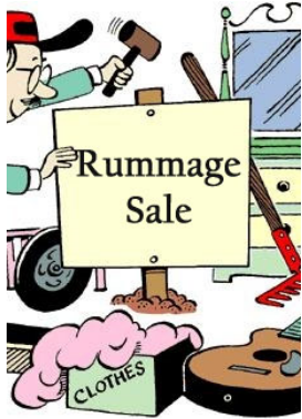
Homemade products, plants, flowers and crafts.