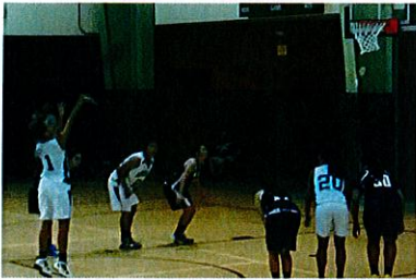
Recent Girl's Basketball Tournament at Kawānanākoa Hall Gym in Keaukaha! (Nov. 23, 2012)

Girls JV and Varsity Soccer Boys JV and Varsity Soccer Girls Basketball Boys JV and Varsity Basketball Swimming Wrestling Canoe Paddling