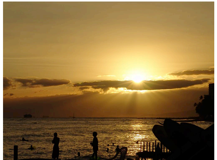
ON my free time, I like taking pictures of the sunset, or going to the beach surfing.