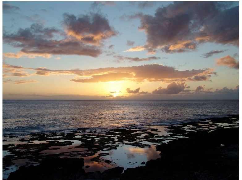
This is a typical day on o'ahu.