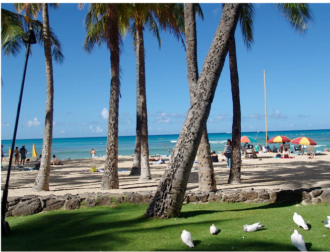
Me and my family usually spend time at the beach surfing or swimming.