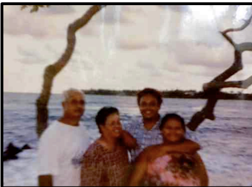
THIS IS A PICTURE OF MY FAMILY THERE IS ONLY FOUR OF US.