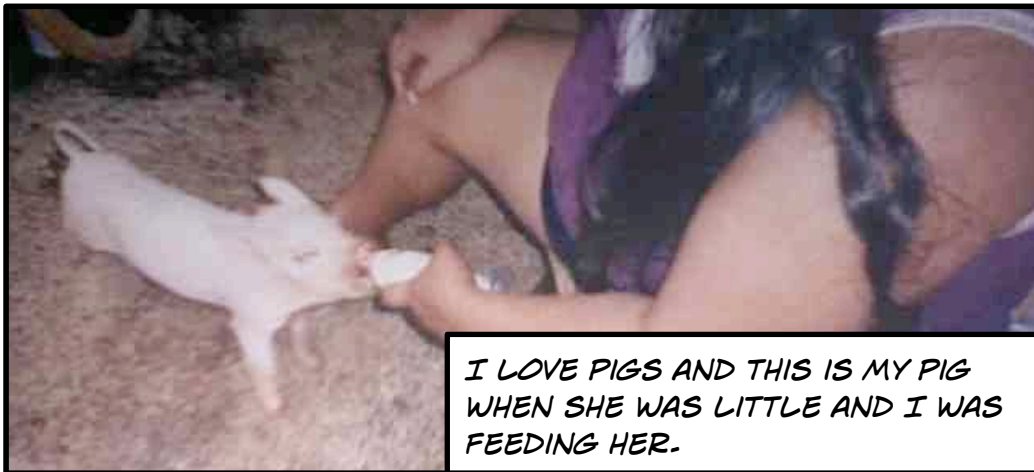
I LOVE PIGS AND THIS IS MY PIG WHEN SHE WAS LITTLE AND I WAS FEEDING HER.