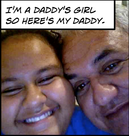
I'M A DADDY'S GIRL SO HERE'S MY DADDY.