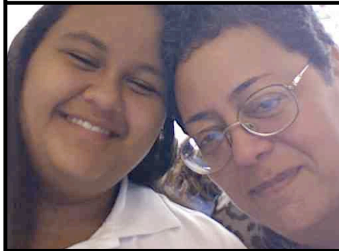
THIS IS MY MOM AND I AT OUR BACK TO SCHOOL DAY.