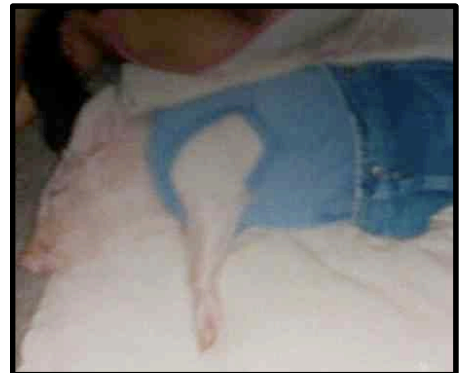
THIS IS THE SAME PIG BUT SHE HAS CLOTHES ON AND SLEEPING.