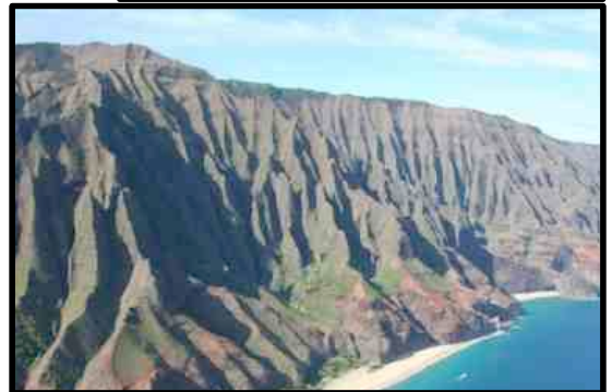
I'M FROM THE ISLAND OF KAUAI AND I BOARD AT KAMEHAMEHA. THIS IS THE NA