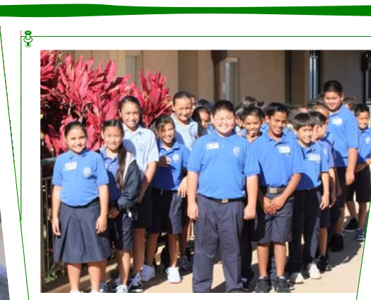
5th graders are ready to lead the Elementary School Division!