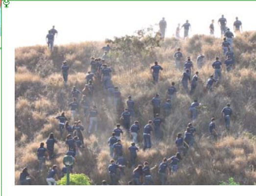
Freshman take to the hill during Freshman Orientation activities.