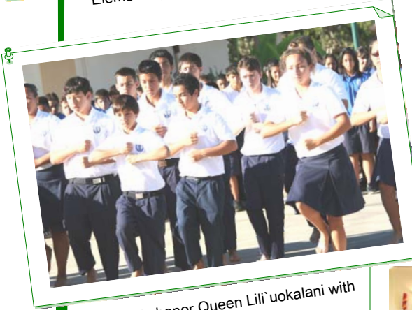
MS students honor Queen Lili'uokalani with hula on her birthday.