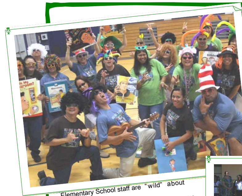
Elementary School staff are "wild" about