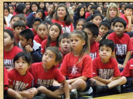
The purpose of students and staff wearing red, is to display Hawaiian unity. Makahiki will be the focus of the October all school event.