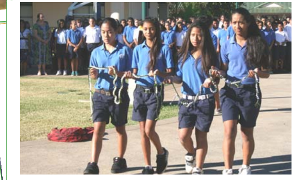
Students offer ho'okupu to Queen Lili'uokalani.