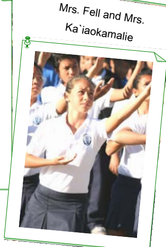
In honor of the Queen's birthday.