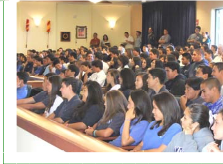
High School student audience at the High School Convocation.