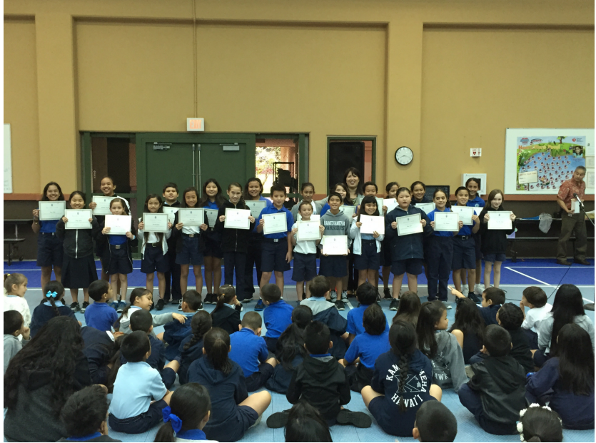
Principal List Awardees: