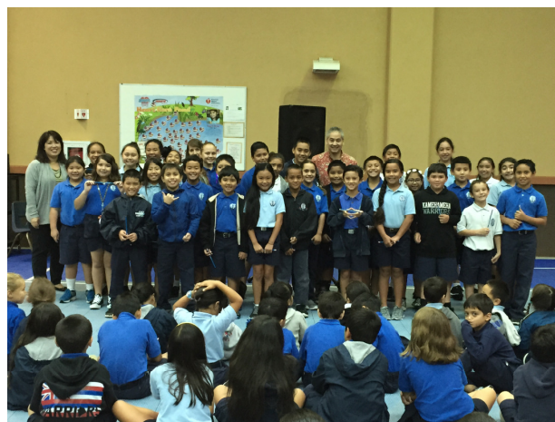
3rd-5th Grade Perfect Attendance Awardees

Students who attended school on time for 58 days during the second trimester were given a certificate and a “Perfect Attendance” pencil.