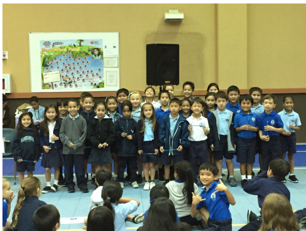
K-2 Perfect Attendance Awardees