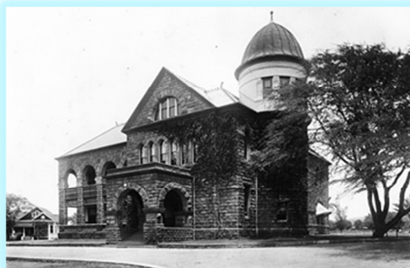
Bishop Hall (original campus)

Tomorrow's Founder's Day, December 19 th , is an extra special one as we commemorate the birthday of our beloved Ke Ali'i Bernice Pauahi Bishop and celebrate this special anniversary. We are grateful for her vision to bequeath her lands to form a school for children of Hawaiian ancestry. What started out as a campus with 37 students now extends to nearly 40,000 learners and caregivers state wide. Our founder, through her generosity, gave the gift of education through her 'āina. We are forever indebted to her.