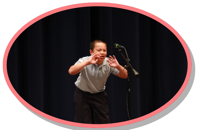
Speech Festival Finals (page 4)

Check out our website: blogs.ksbe.edu/hes