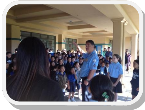
Uncle Tom speaking to our kula