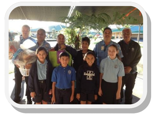
Security Staff with 'Aha 'Ōpio