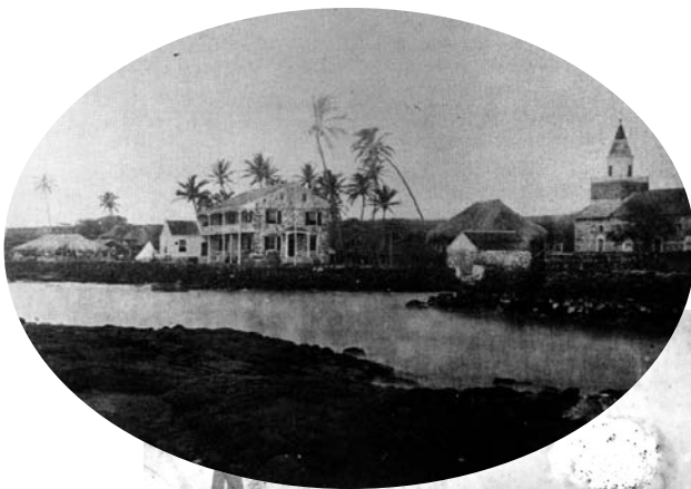
HALE'ŌLELO, KE'ELIKŌLANI'S TRADITIONAL HOME IN KAILUA, KONA; INSET: HULIHE'E PALACE IN THE 1860s, PHOTOGRAPHED FROM THE SEASIDE.

During the Princess's lifetime, large numbers of Hawaiians were converting to Christianity, reflecting in part a traditional Hawaiian response to increasing deaths caused by foreign diseases against which Hawaiians had little or no immunity. As traditional Hawaiian worship of the major deities Kū, Kāne, Lono, and Kanaloa had been officially abolished in 1819, Christianity was now the religious means to attain spiritual and physical harmony that, from a traditional Hawaiian perspective, could restore good health to those who were ill. Despite the pressures from haole missionaries and Hawaiians alike, Ke'elikōlani saw value in traditional ways. Determined to uphold the honor of her ancestors, she retained many traditional religious practices. Although she learned English among other subjects at the missionary-run Chief's Children's School, she was a staunch supporter of the Hawaiian language and traditional cultural practices. She insisted that she be addressed only in Hawaiian, requiring non-Hawaiian speakers to use translators if they wished to communicate with her. And despite owning Hulihe'e, a Western-style house in Kailua, Kona, she chose to live in a large, traditional grass home on the same oceanfront property.