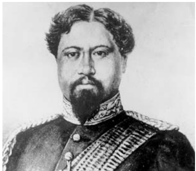
CLOCKWISE FROM TOP: KAMEHAMEHA I, KEKUANAO'A. LOT KAMEHAMEHA, RUTH KE'ELIKOLANI WITH HER SON LELEIOHOKU, BERNICE PAUAAHI, AND WILLIAM PITT KINA'U.